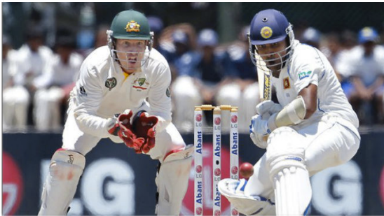
Boxing Day Cricket Test, Australia v. Sri Lanka