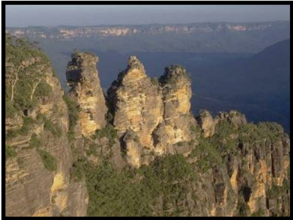
The Blue Mountains are on the southeastern end of Australia.

Australia has many different kinds of landforms and bodies of water. The land in Australia is very different on the coasts and in the center. The coasts have beaches, and the interior (called the Outback) is mainly desert. Grasslands, plateaus and mountains are also found in Australia. Because it is an island, water is all around the continent of Australia. There are also many rivers that run through the northern part of the country, and lakes throughout the country. As you can see, Australia has a variety of different kinds of land.