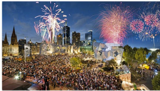
Australia Day fireworks, Federation Square, Melbourne