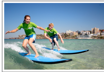
Surfing the coast in Australia

Because of the miles of coastline available in Australia, surfing is a popular pastime with outdoor-lovers of all ages. In all major cities, like Sydney, Perth, or Hobart, surfers can catch a wave at famous places like Bondi Beach, Bells Beach, the Gold Coast or Byron Bay.