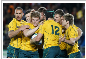
Australia National Rugby Team

Rugby is one of the most popular sports in Australia. It is similar to both American football and soccer. The Australian Rugby League has 16 teams from all over the country. It's often called "the working man's sport" and is played and watched by many around Australia. Since 1993, there have been both men's and women's leagues.