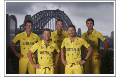
2015 ICC Australia Cricket Team

Soccer, which is called football in Australia, is the most widely-played outdoor sport. The national teams in Australia are called the Socceroos (mens) and the Matildas (womens). There is also an indoor version of football, called futsal, that is popular with players in the country. It was created in 1970 after there was so much rain that the sport couldn't be played outside.