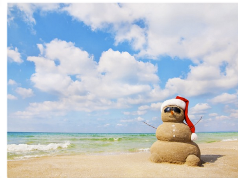
Sandman on a beach in Adelaide for Christmas

Parades are often held throughout Australia to commemorate the landing of the Australian and New Zealand troops in Turkey during WWI.