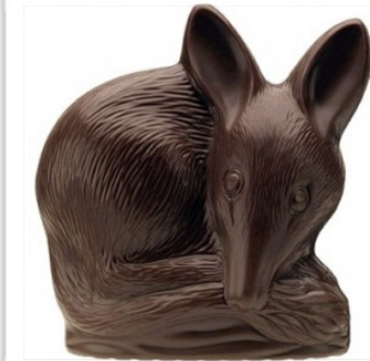
Traditional chocolate Easter bilby